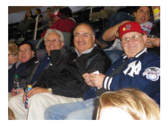
Greek Night at the Ballpark Washington Nationals vs. Florida Marlins Game!