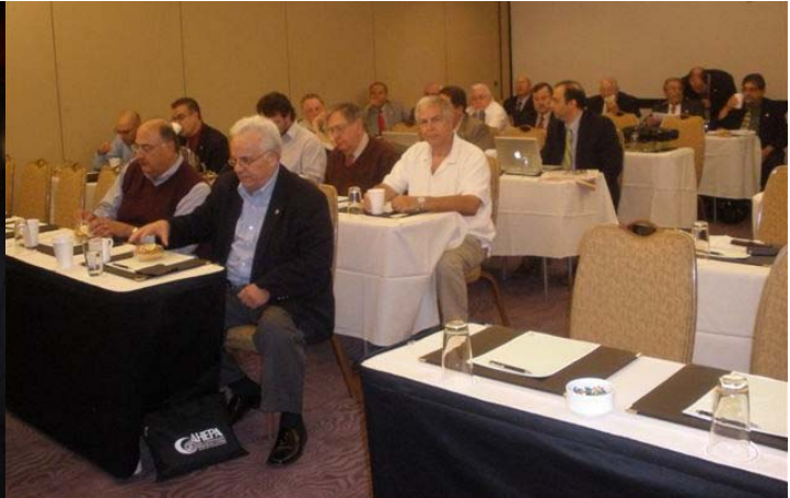
District Governor Emmanuel Moshovos with District Lt. Governor Jack Isaac attend the National Governor's meeting in Washington, DC